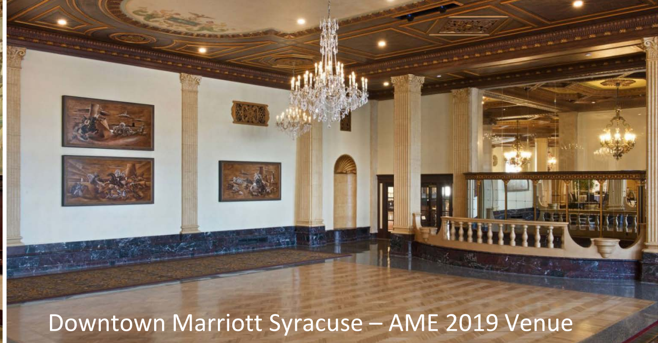
Downtown Marriott Syracuse – AME 2019 Venue