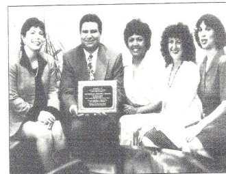
NYSDA Legislative Leaders, 1996.