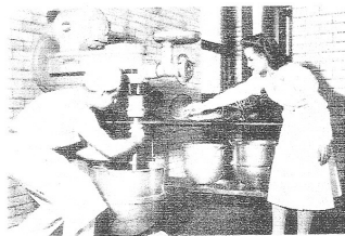
Flyer promoting the role of the hospital dietitian, circa 1950's Roosevelt Hospital, NYC