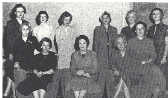
NYSDA Board and Delegates at the Washington Convention, 1950.